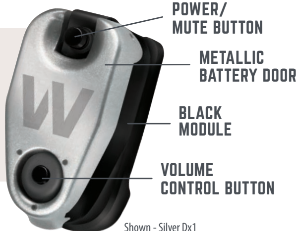
Shown - Silver Dx1